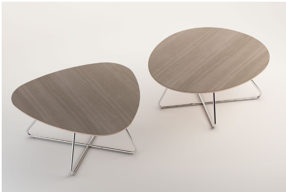
Almost Triangle and Egg Shape