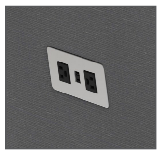
POWER / DATA