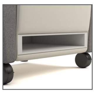
LAMINATED STORAGE SHELF