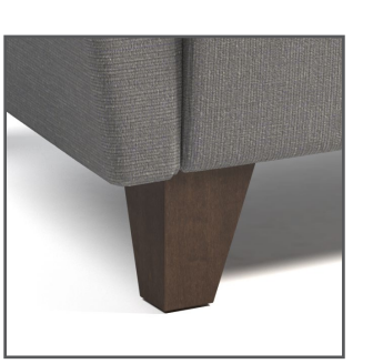
MAPLE WOOD LEGS