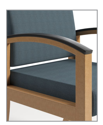
OPTIONAL BLACK POLY ARM CAPS