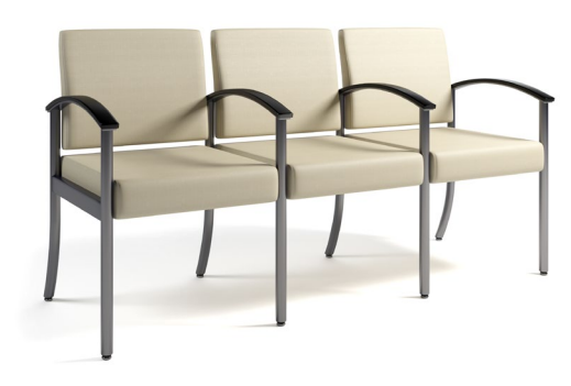
THREE SEAT ARM CHAIR