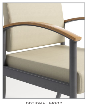
OPTIONAL WOOD ARM CAPS