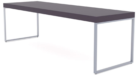
PARMA STRAIGHT METAL LEG