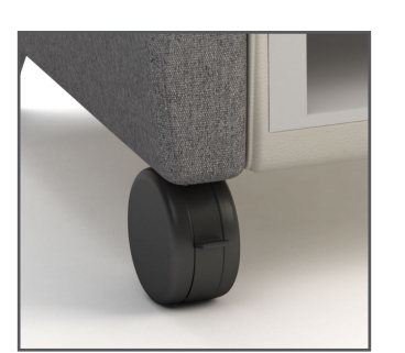
4" LOCKING CASTERS - BLACK