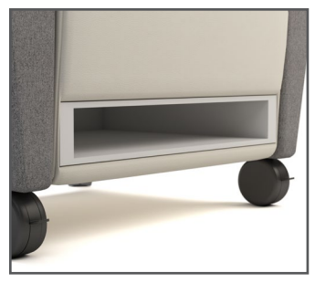
LAMINATED STORAGE SHELF