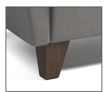
MAPLE WOOD LEGS