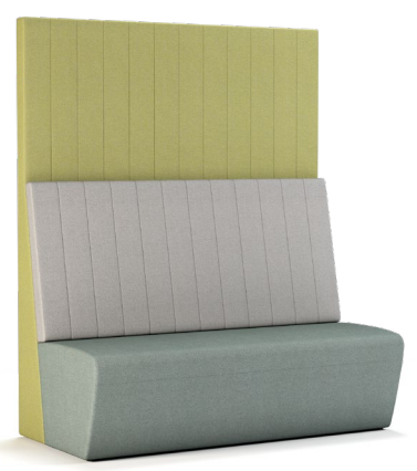
72"H PANEL SHOWN WITH OPTIONAL PANEL CHANNEL TUFTING AND THREE FABRICS.