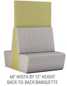
MODEL / DESCRIPTION / LIST PRICING