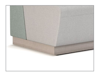
BANQUETTE COMES WITH A FLUSH PLINTH BASE ON SIDES FOR GANGING, AND RECESSED FRONT.