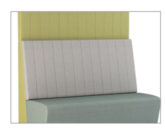
THREE FABRIC OPTION