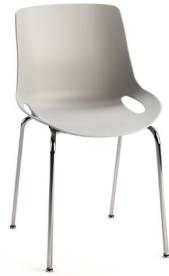
SIDE CHAIR FRONT VIEW

Our Elliot chair collection has added the 5 Star swivel on casters for our Junior offering. This collection encompasses multiple heights for flexibility at any table surface and its versatility meets the needs of any educational space. This Mid Century modern design, features a contoured polypropylene shell with a vertical grooved back design and two clean outs on the seat.