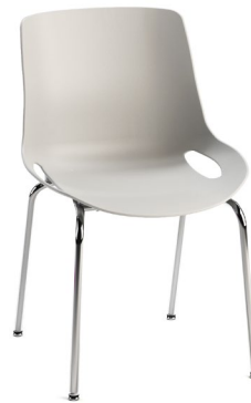
4-LEG JUNIOR CHAIR