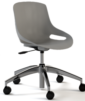
5 STAR BASE - JUNIOR CHAIR