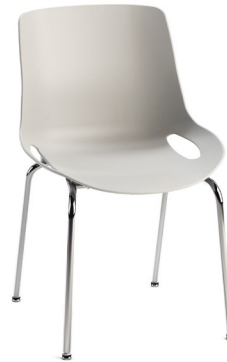
4-LEG JUNIOR CHAIR