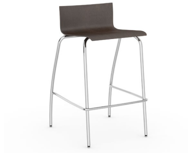
4-LEG DEMI BACK STOOL