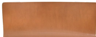
SOLID BACK (STANDARD)