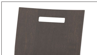
HAND GRIP CUTOUT