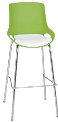
BAR STOOL WITH UPHOLSTERED SEAT INSERT