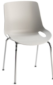
4-LEG JUNIOR CHAIR