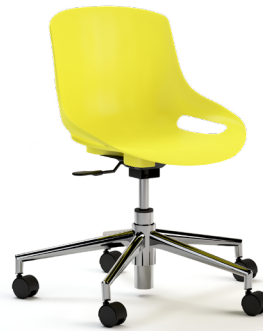
5 STAR BASE - JUNIOR CHAIR