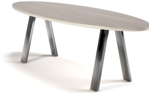
ASPEN CONFERENCE TABLE SHOWN WITH OPTIONAL CHROME LEGS AND OVAL TOP