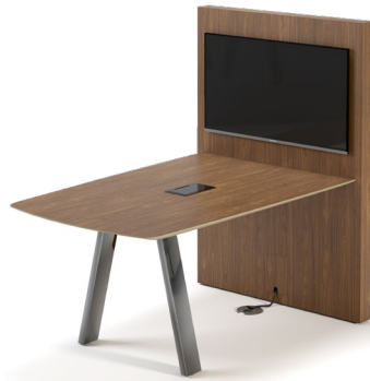
MEDIA TABLE WITH METAL LEGS AND OPTIONAL POWER/DATA AND ALMOST RECTANGLE TOP