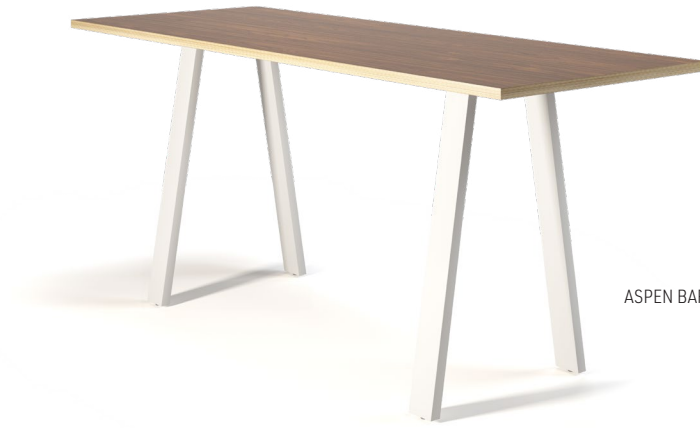
ASPEN BAR HEIGHT TABLE