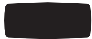
ALMOST RECTANGLE TOP CODE: CAT