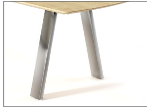
POLISHED CHROME LEG