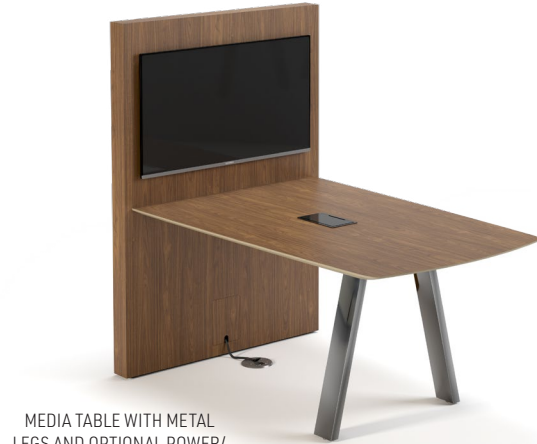
MEDIA TABLE WITH METAL LEGS AND OPTIONAL POWER/DATA AND ALMOST RECTANGLE TOP