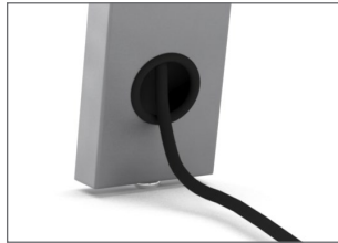
POWER LEG WITH GROMMET