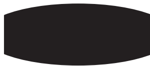
BOAT TOP CODE: CBT