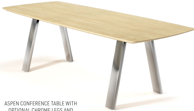
ASPEN CONFERENCE TABLE WITH OPTIONAL CHROME LEGS AND ALMOST RECTANGLE TOP

The Aspen tables offer a dynamic style for conferencing and meeting areas. It offers conference tables, as well as a bar height table with a power bar and a media wall table, great for a touchdown meeting. The sharp and substantial angled leg creates a dynamic look offered in both metal or wood legs, that convey a bold and stylish look with a solid foundation.