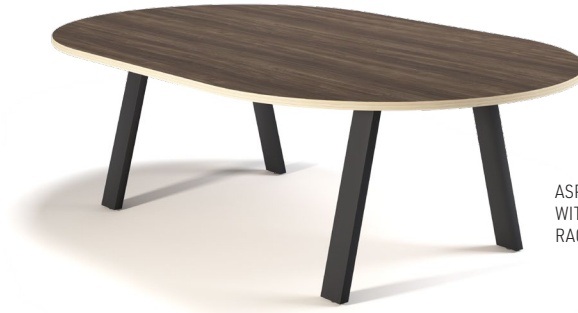
ASPEN CONFERENCE TABLE SHOWN WITH WOOD LEGS AND OPTIONAL RACE TRACK TOP