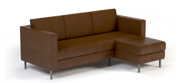
THREE SEAT SAMMY LOUNGE WITH CHAISE