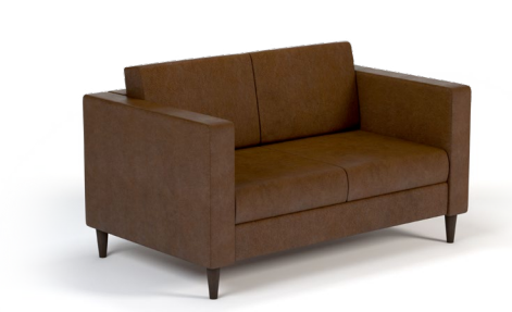
TWO SEAT LOUNGE WITH OPTIONAL WOOD LEGS

Metal Legs: Polished Chrome Wood Legs: Standard Wood Stain