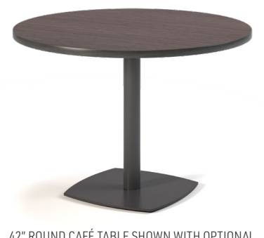
42" ROUND CAFÉ TABLE SHOWN WITH OPTIONAL POWDER COAT FINISH