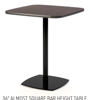
36" ALMOST SQUARE BAR HEIGHT TABLE SHOWN WITH OPTIONAL POWDER COAT FINISH