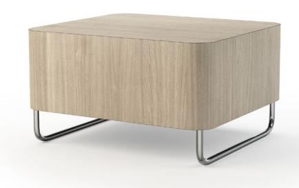
27.5" X 30" COFFEE TABLE