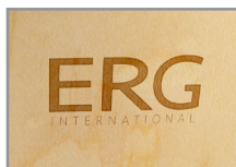
LASER ENGRAVING - FRONT OR BACK