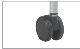
2" CASTERS - CAS2