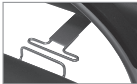
METAL GANGING - GD