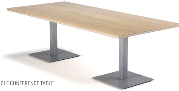
42X96" RECTANGLE CONFERENCE TABLE