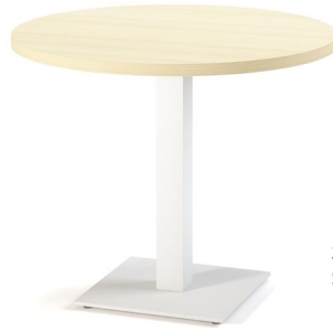
36" ROUND CAFÉ TABLE SHOWN WITH OPTIONAL POWDER COAT FINISH