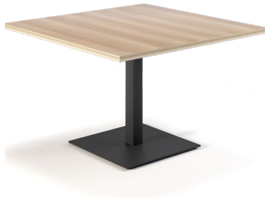
48" SQUARE CAFÉ TABLE SHOWN WITH OPTIONAL POWDER COAT FINISH

Monaco tables features a unique square stainless steel column and base. The collection consists of café and conference tables that nicely complement any modern café area or meeting room.