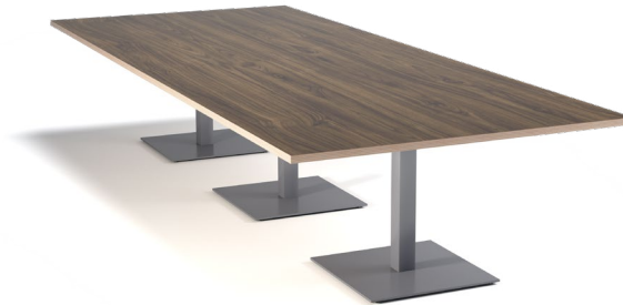
60X144" RECTANGLE CONFERENCE TABLE