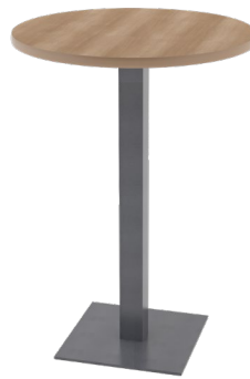
30" ROUND BAR HEIGHT TABLE