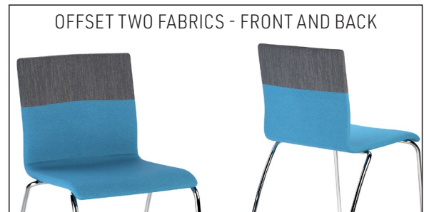
OFFSET TWO FABRICS - FRONT AND BACK