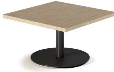
SQUARE TOP OCCASIONAL TABLE SHOWN WITH OPTIONAL POWDER COAT BASE