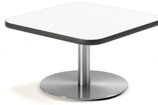
4" RADIUS CORNER TOP OCCASIONAL TABLE SHOWN WITH STANDARD STAINLESS STEEL BASE