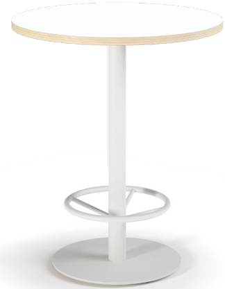
ROUND BAR HEIGHT TABLE SHOWN WITH OPTIONAL FOOTRING