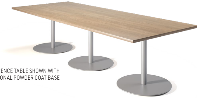
RECTANGLE CONFERENCE TABLE SHOWN WITH OPTIONAL POWDER COAT BASE