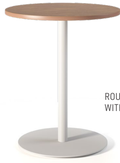
ROUND BAR HEIGHT TABLE SHOWN WITH OPTIONAL POWDER COAT BASE