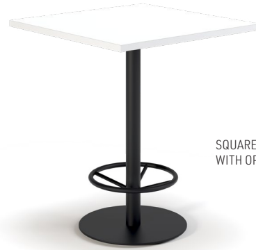
SQUARE BAR HEIGHT TABLE SHOWN WITH OPTIONAL FOOTRING