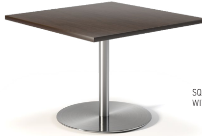
SQUARE CAFÉ TABLE SHOWN WITH STAINLESS STEEL BASE