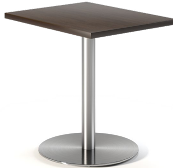
SQUARE CAFÉ TABLE SHOWN WITH STAINLESS STEEL BASE