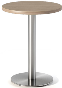
ROUND CAFÉ TABLE SHOWN WITH STAINLESS STEEL BASE

The Corsa table collection has a classic and timeless look with a simple round base with a 3" and 6" diameter stainless steel column. The ultimate setting for this series is the cafe spaces that can offer any chair with comfort.