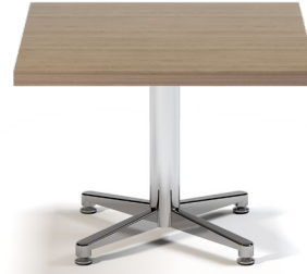
24" SQUARE OCCASIONAL TABLE