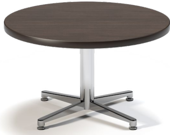
30" ROUND OCCASIONAL TABLE