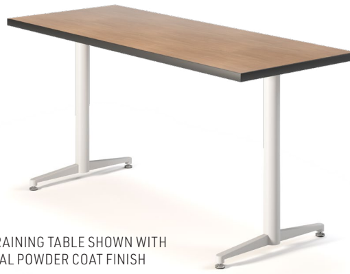
24" X 60" TRAINING TABLE SHOWN WITH OPTIONAL POWDER COAT FINISH