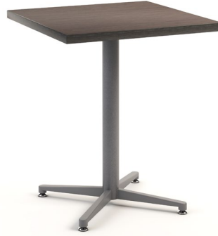
30" SQUARE CAFÉ TABLE SHOWN WITH OPTIONAL POWDER COAT FINISH