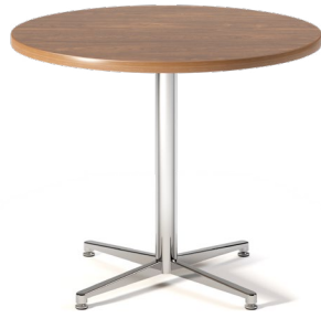
36" ROUND CAFÉ TABLE