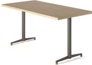
TRAINING TABLE SHOWN WITH OPTIONAL POWDER COAT FINISH