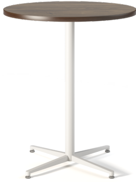
36" ROUND BAR HEIGHT TABLE SHOWN WITH OPTIONAL POWDER COAT FINISH