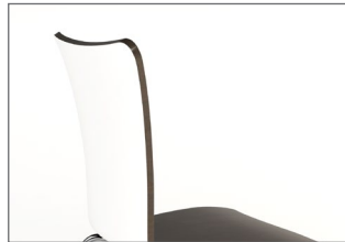
TWO TONE WOOD STAINS