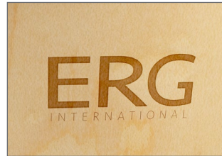
LASER ENGRAVING (FRONT OR BACK)