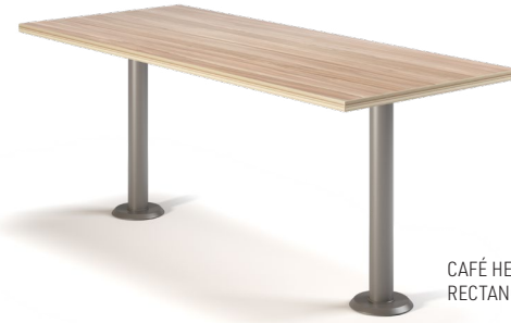
CAFÉ HEIGHT RECTANGLE TABLE