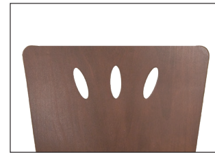
VERTICAL BUBBLE CUTOUT