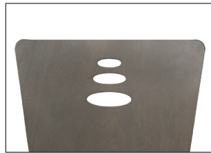
REVERSE BUBBLE CUTOUT (NOT AVAILABLE ON DEMI BACK)