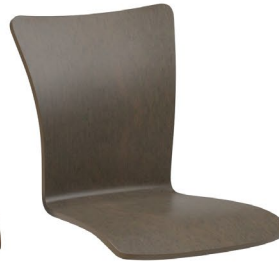
BENTON FULL BACK