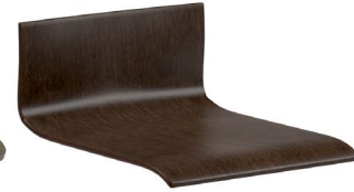
DEKKO DEMI BACK