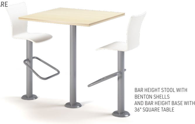
BAR HEIGHT STOOL WITH BENTON SHELLS AND BAR HEIGHT BASE WITH 36" SQUARE TABLE

Note: ERG DOES NOT PROVIDE HARDWARE TO MOUNT TO FLOOR