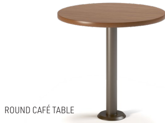
ROUND CAFÉ TABLE