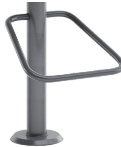
COLUMN BASE WITH FOOT RIGN