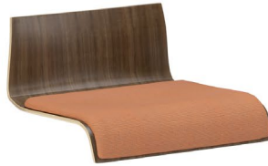
PENTO DEMI BACK