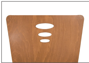
UPRIGHT BUBBLE CUTOUT (NOT AVAILABLE ON DEMI BACK)