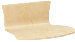
BENTON DEMI BACK