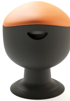
BLACK POLY BASE WITH TANGERINE IN-STOCK VINYL