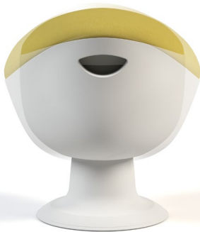
8° TILT IN ALL DIRECTIONS