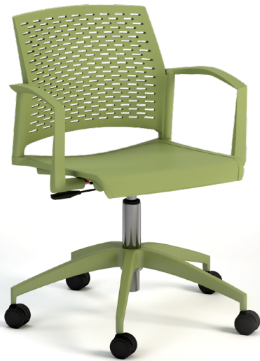
GREEN POLY WITH CANARY GREEN POWDER COAT BASE