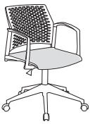
7629 Swivel Arm Chair - Upholstered Seat Insert