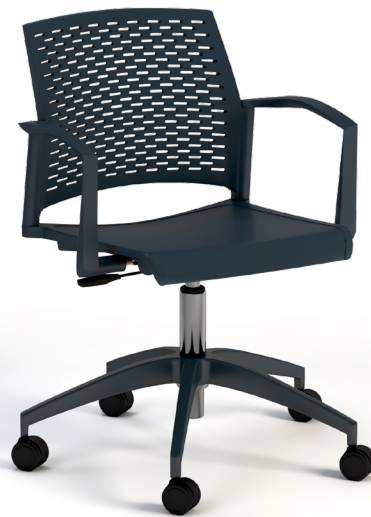
NAVY BLUE POLY WITH NAVY BLUE POWDER COAT BASE