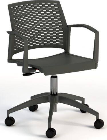
CHARCOAL POLY WITH CHARCOAL POWDER COAT BASE