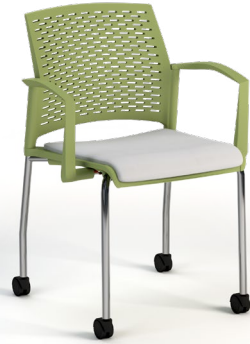
4 LEGGED WITH ARMS AND CASTERS