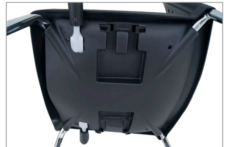
OPTIONAL SEAT PAN TO PROTECT UPHOLSTERY