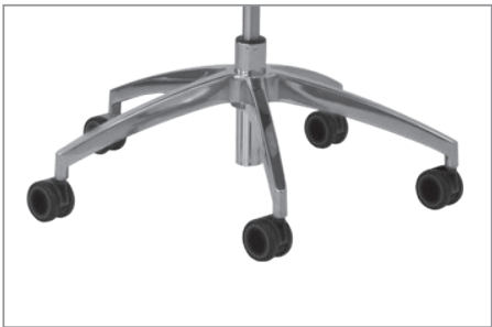
STANDARD ALUMINUM SWIVEL BASE