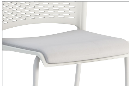
UPHOLSTERED SEAT INSERT