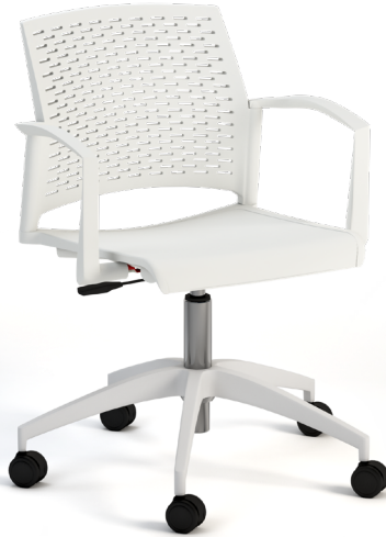
WHITE POLY WITH WHITE MATTE POWDER COAT BASE