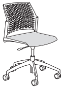
7625 Swivel Chair - Upholstered Seat Insert