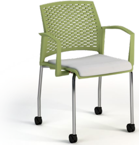
4 LEG CHAIR / ARMS / CASTERS

The Rewind chair features a two piece polypropylene shell with a slotted back and a clean out feature. The slotted back design offers style and ventilation. Frames are available in standard polished chrome or optional powder coat color finishes.