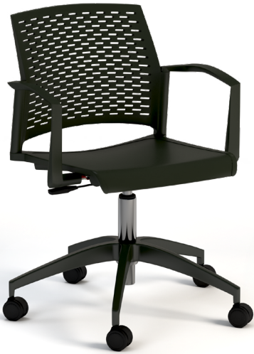
BLACK POLY WITH BLACK MATTE POWDER COAT BASE