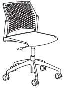
7624 Swivel Chair