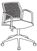
7628 Swivel Arm Chair