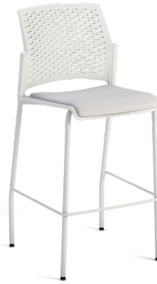
BAR STOOL WITH UPHOLSTERED SEAT INSERT