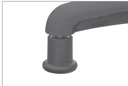
SWIVEL CHAIR GLIDES