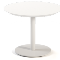
ROUND TOP AND ROUND BASE